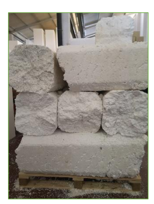
Illustration: compacted material

In figures, Aislamientos Arellano recycles around 345,000 Fish boxes a year, which represents a total volume of 45 tons, its main activity area is País Vasco region (Spain).